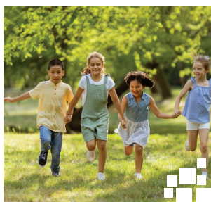
Exercise in Childhood